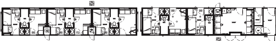
2 TYP. 3 BED SLEEPER SCALE: NTS